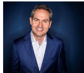
2023 Comedian: Pat McGann

Sponsor a Dental Student: $100/student To help engage the next generation of dental community leaders, 'Dental Student Ticket Sponsors' are available at $100/student—enabling DDS students to join us! Sponsors will be recognized in event marketing and on the student's name tag.